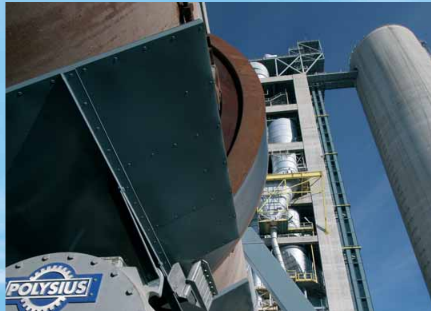
5-stage DOPOL® '90 preheater including PREPOL®-CC-MSC calcining system for 2,600 t.p.d. of cement clinker in Spain.

This ensures that all the systems and plant components are optimally harmonised.