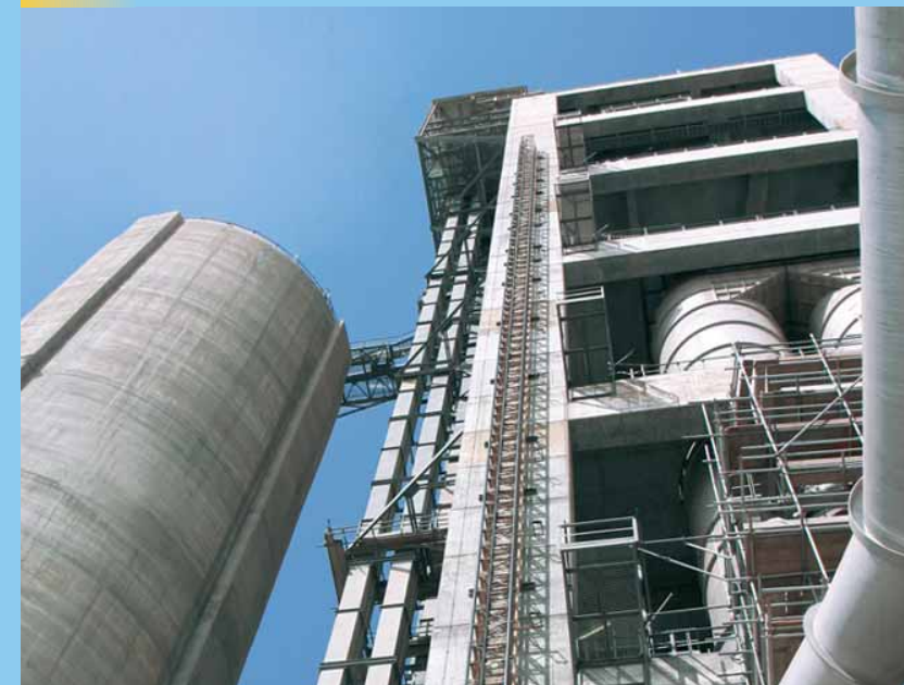
5-stage DOPOL® '90/PREPOL®-AS preheater calciner combination in Saudi Arabia; designed for a daily production rate of 3,500 tonnes of grey cement clinker.

The Polysius PREPOL®-AS calciner programme (AS stands for Air Separate; a concept which all PREPOL® types share) thus includes a selection of versions, -CC, -MSC and -MSC-CC, in order to optimally fulfil individual requirements with regard to operating reliability, product quality, flexibility and emission reduction.